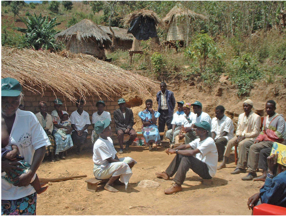
Community outreach sessions cover topics including child growth monitoring and immunization.

outreach sessions in coordination with its own staff. During these sessions, child survival staff and volunteers assisted with tasks including growth monitoring and counseling.