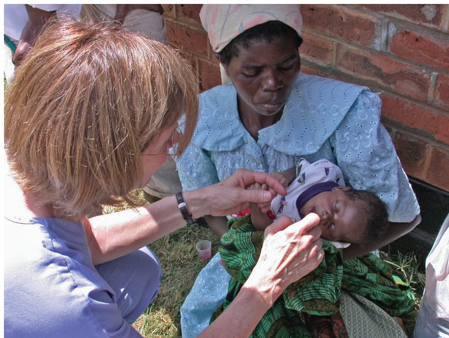
In Malawi, health surveillance assistants provide weekly immunization services at health posts.

same time as World Relief promoters, assist in the training of Care Groups and participate in home visits with promoters. They will assume supervision of Care Groups by the end of World Relief's 2005–2009 child survival program.