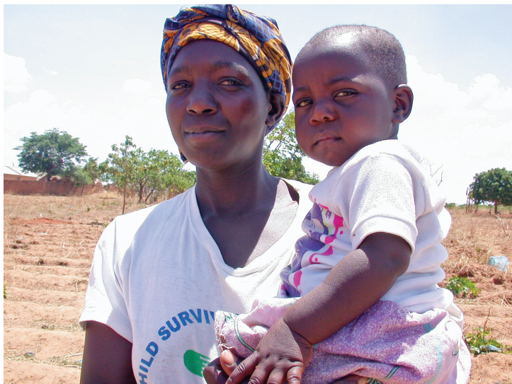
Through World Relief's Care Group model, women are empowered to improve their families' health.

The Care Group model is applied as part of a comprehensive approach to child survival programming; World Relief tailors the model to the specific needs of each country and community it works in. Following successful implementation of Care Groups in Mozambique, World Relief replicated the model in Cambodia, Malawi, Rwanda and Burundi, adapting to local conditions.